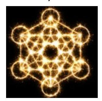
March 6, 2023

You place a magical command on a creature that you can see within range, forcing it to carry out some service or refrain from some action or course of activity as you decide. If the creature can understand you, it must succeed on a Wisdom saving throw or become charmed by you for the duration. While the creature is charmed by you, it takes 5d10 psychic damage each time it acts in a manner directly counter to your instructions, but no more than once each day. A creature that can't understand you is unaffected by the spell.