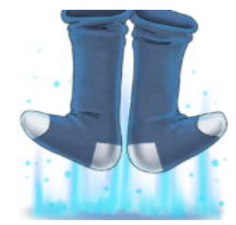
Wondrous Item, uncommon

These stockings allow you to levitate as the spell up to an hour per day. This does not provide horizontal movement, but you can